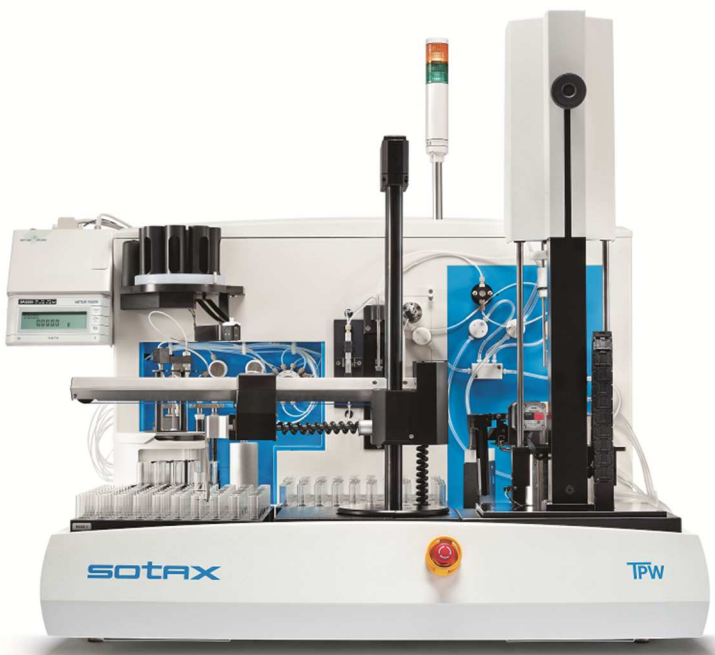
SOTAX TPW Automated Sample Preparation Workstation