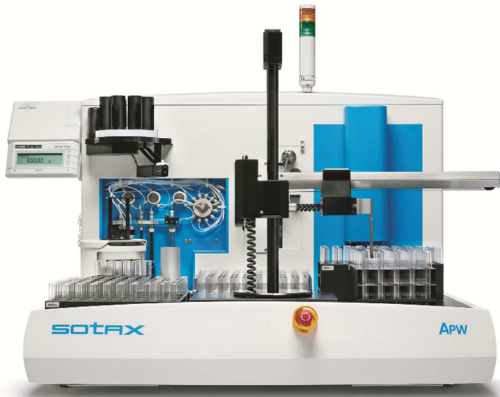
SOTAX APW Automated Sample Preparation Workstation