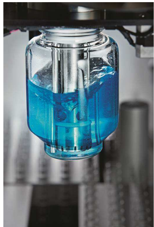
TPW extraction vessel