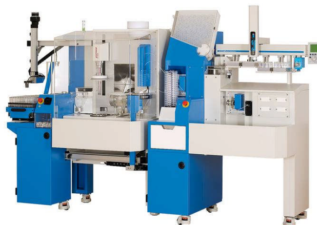
The Zymark® TPW3 (left) and SOTAX CTS (right)

for automated tablet assay are two automated analytical tools on the market.